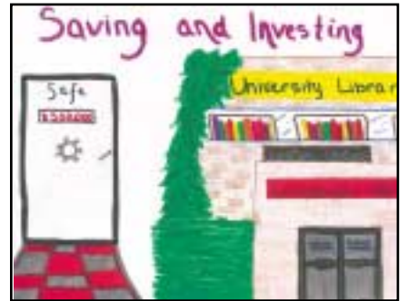
Heather Spence Forrest Rhode Boys & Girls Club