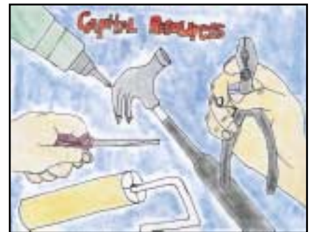
Nathan Derheimer South Grove Intermediate