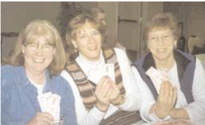
Just wait until the auction!

So, on behalf of Indiana students, please consider supporting the programs of ICEE. It will be money well spent.