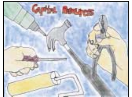
Nathan Derheimer South Grove Intermediate